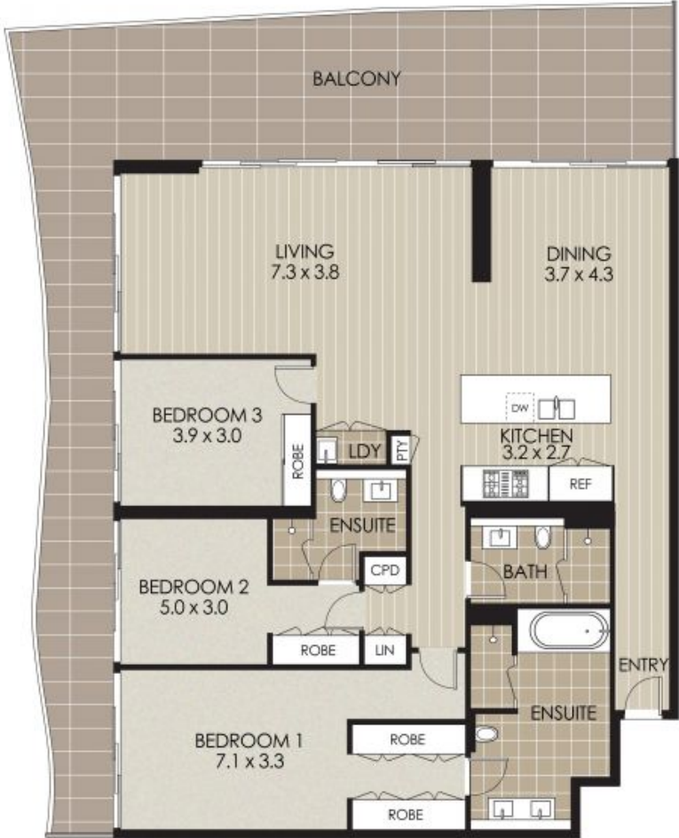
APARTMENT (LEVEL 53) FLOOR PLAN