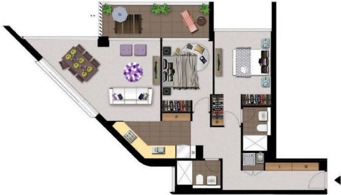
Unit 2709 LEVEL 27