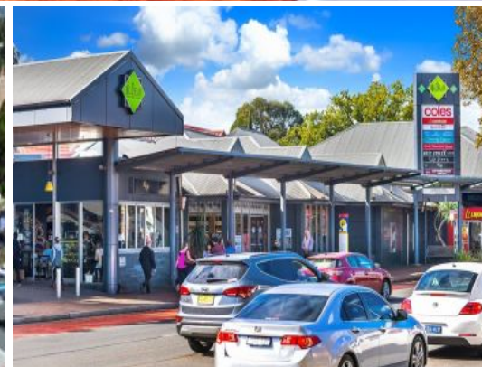
Level 2/71 Military Road Neutral Bay, NSW