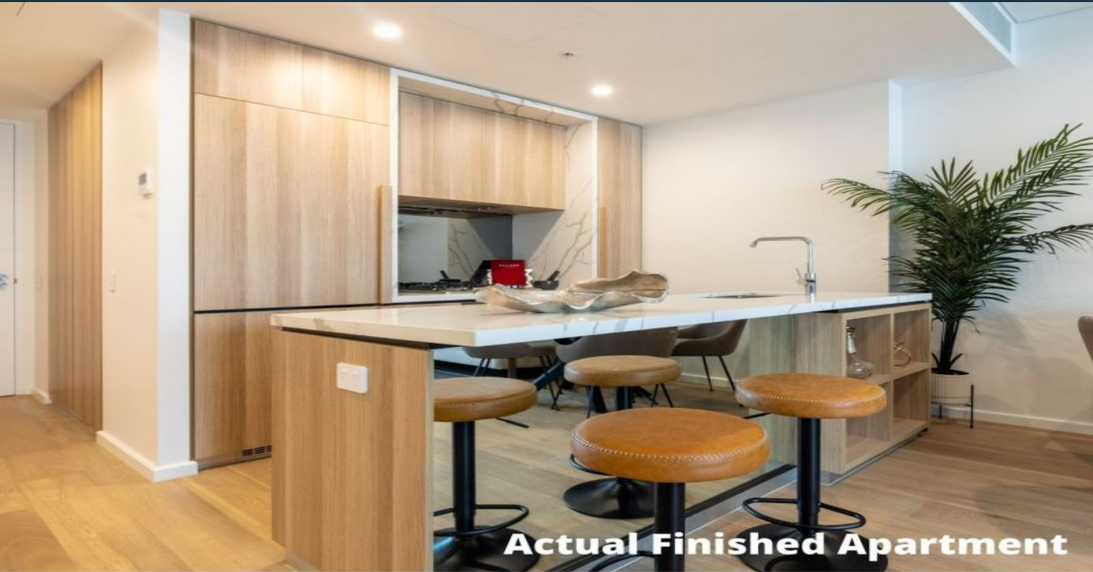
Actual Finished Apartment