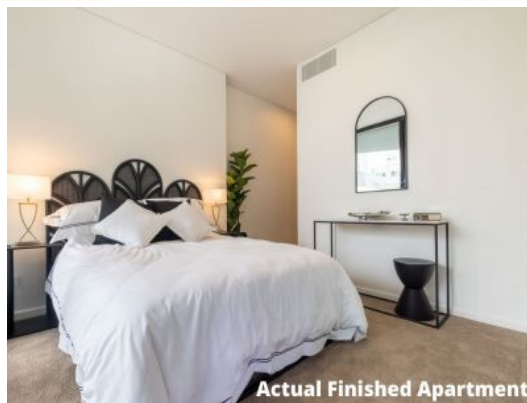
Actual Finished Apartment